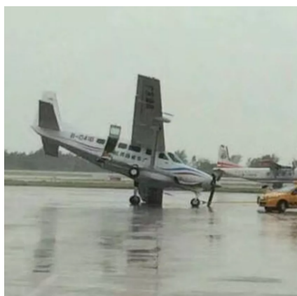
Typhoon Hato airport images