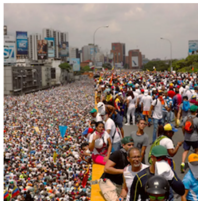
Venezuela airspace risk – brink of civil war?

Weekly International Ops Bulletin published by FSB for OPSGROUP covering critical changes to Airports, Airspace, ATC, Weather, Safety, Threats, Procedures, Visas. Subscribe to the short free version here, or join thousands of your Pilot/Dispatcher/ATC/CAA/Flight Ops colleagues in OPSGROUP for the full weekly bulletin, airspace warnings, Ops guides, tools, maps, group discussion, Ask-us-Anything, and a ton more! Curious? See what you get. Rated 5 stars by 125 reviews .