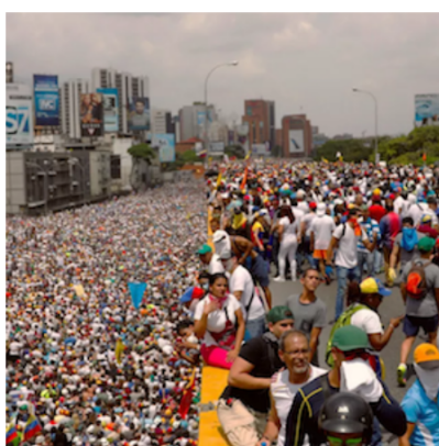
Venezuela airspace risk – brink of civil war?

Weekly International Ops Bulletin published by FSB for OPSGROUP covering critical changes to Airports, Airspace, ATC, Weather, Safety, Threats, Procedures, Visas. Subscribe to the short free version here, or join thousands of your Pilot/Dispatcher/ATC/CAA/Flight Ops colleagues in OPSGROUP for the full weekly bulletin, airspace warnings, Ops guides, tools, maps, group discussion, Ask-us-Anything, and a ton more! Curious? See what you get. Rated 5 stars by 125 reviews .