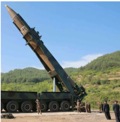
Here's why North Korean missiles are now a real threat

ISSUED BY FLIGHT SERVICE BUREAU SITA HNLFSXH AKLFSXH AFTN KMCXAAL EMAIL INTL.DESK@FSBUREAU.ORG