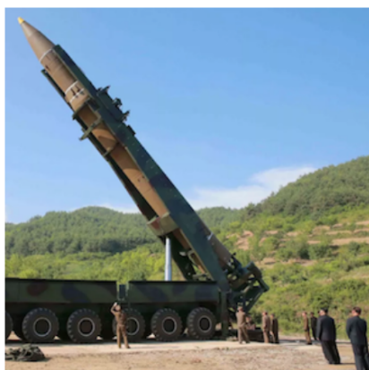
Here's why North Korean missiles are now a real threat