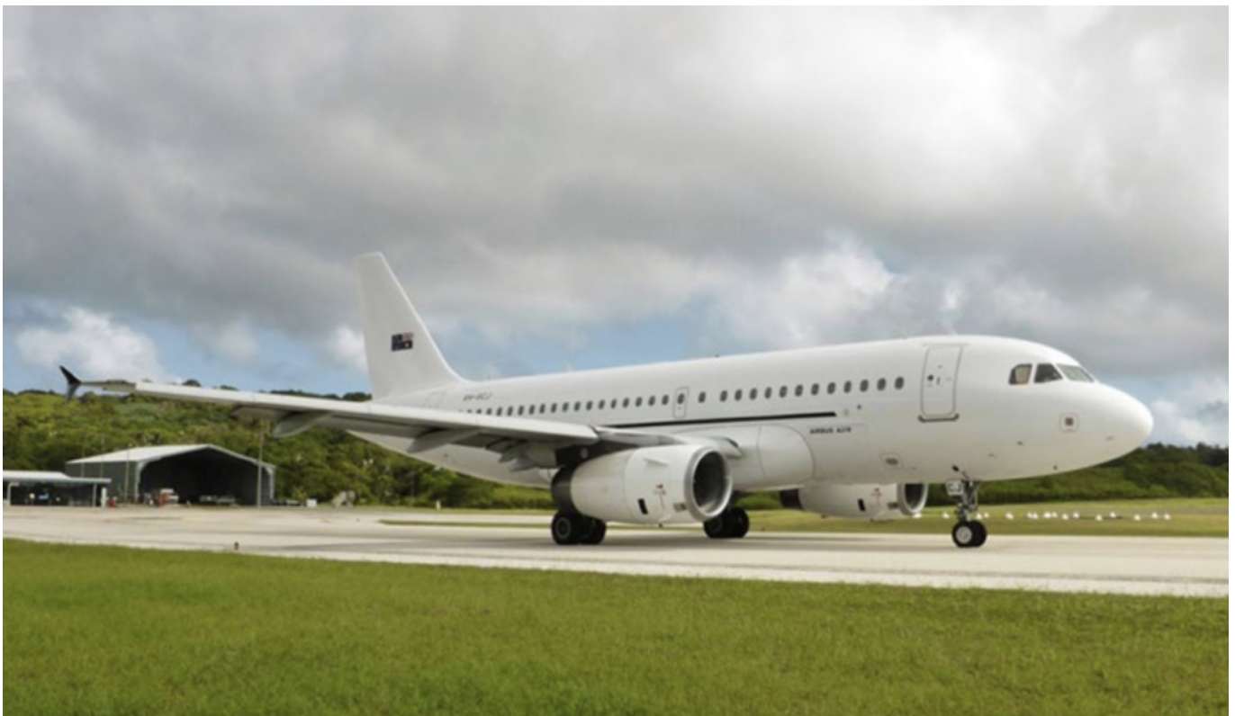
Snowbird. A great example of when good automation goes wrong.

After the incident neither pilot could recall exactly what happened, what modes they had engaged and neither had heard any of the EGPWS warnings. The automation had performed flawlessly throughout by providing the crew exactly what it was told to do. When it all went wrong, it seems the pilots were reluctant to turn it all off.