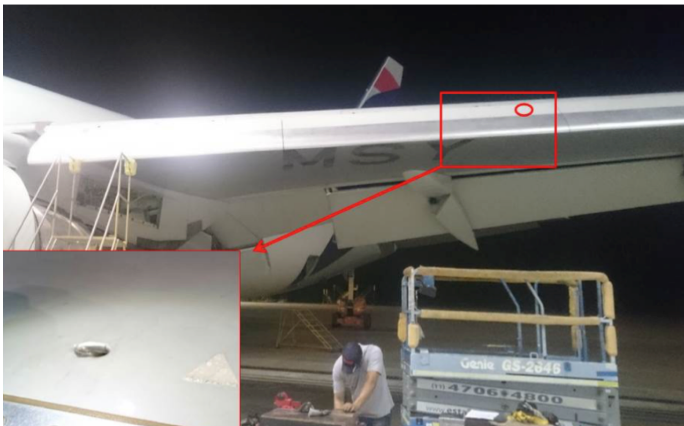
Section of wing with lodged bullet