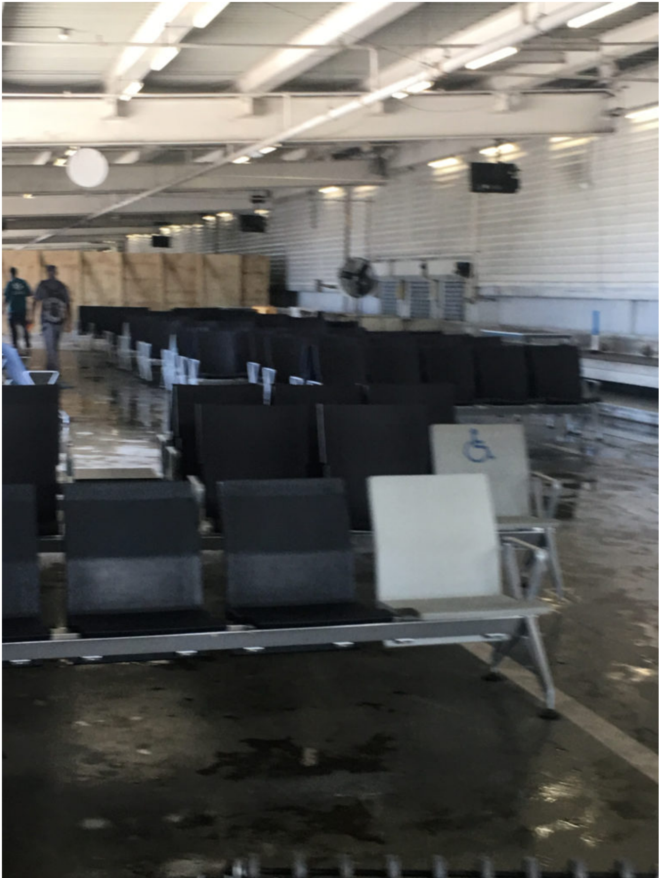
Passenger area set up in hangar.