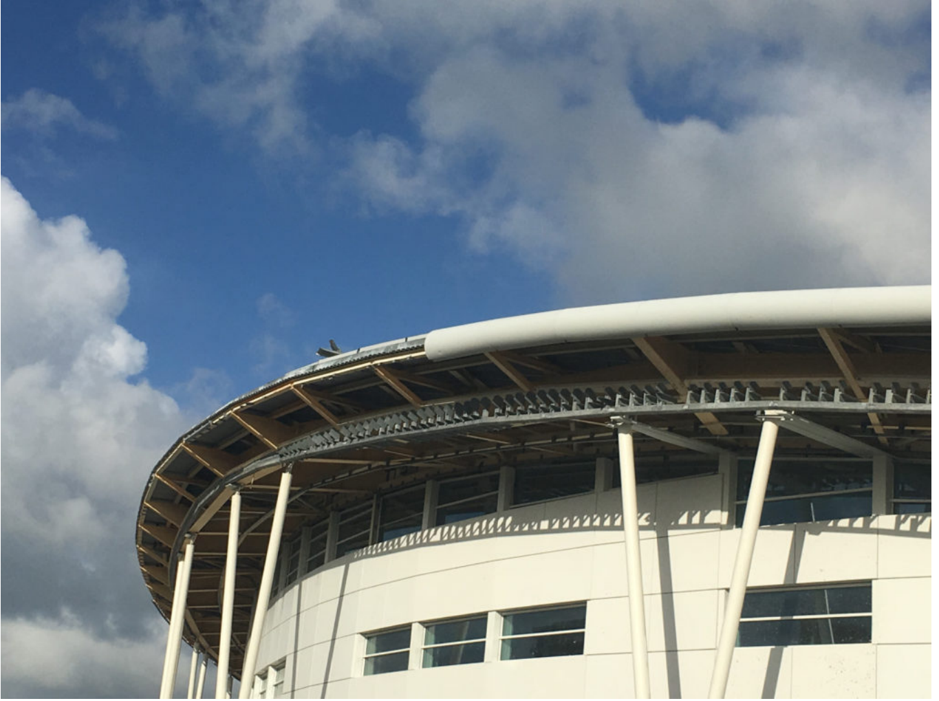
Roof Repairs are Ongoing