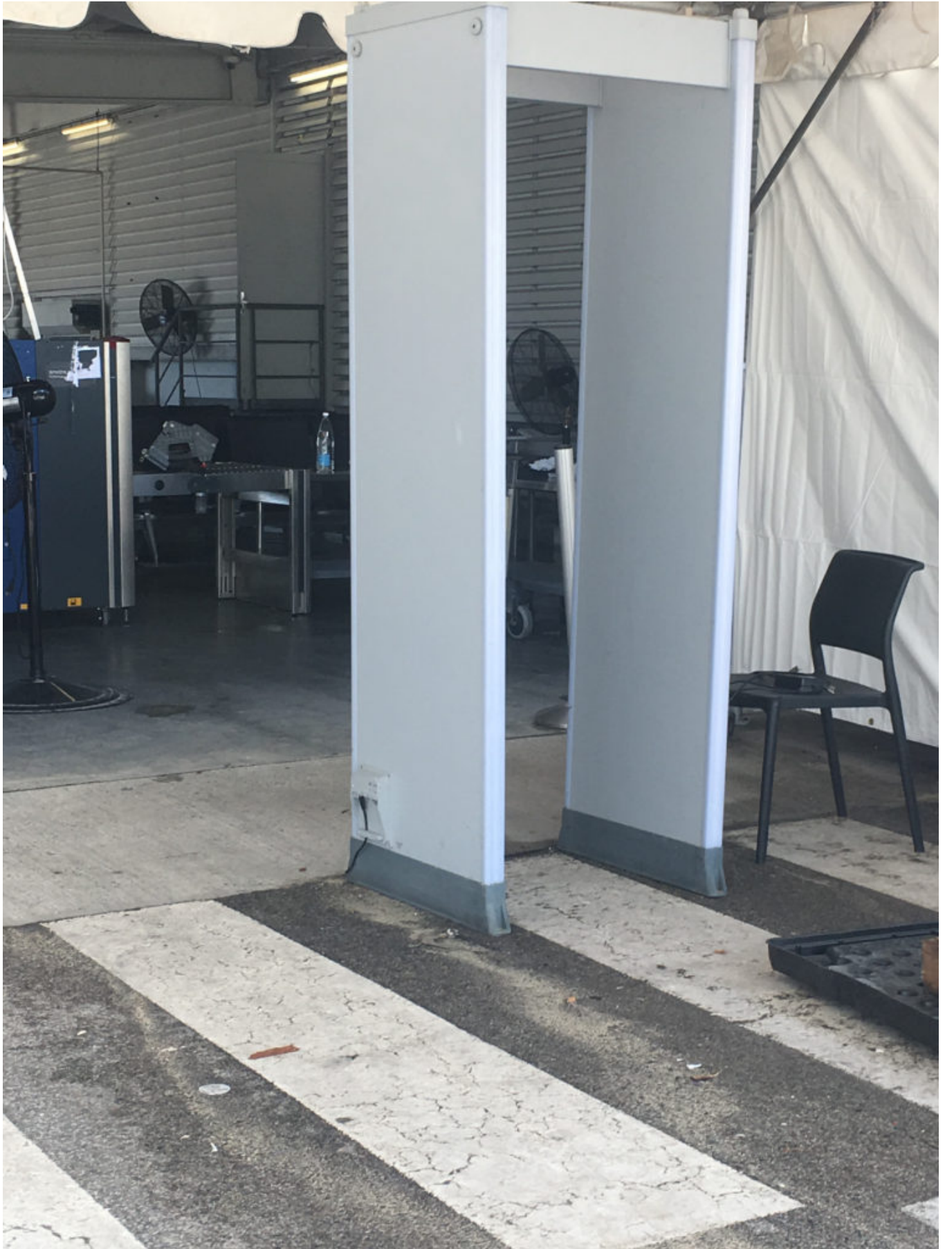
New Security Checkpoints