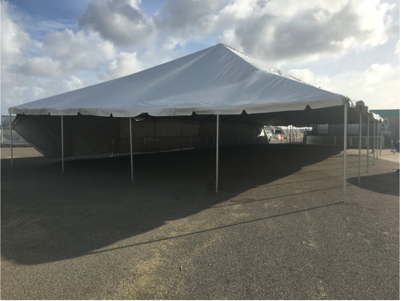
Tents being set up while terminal out of service.