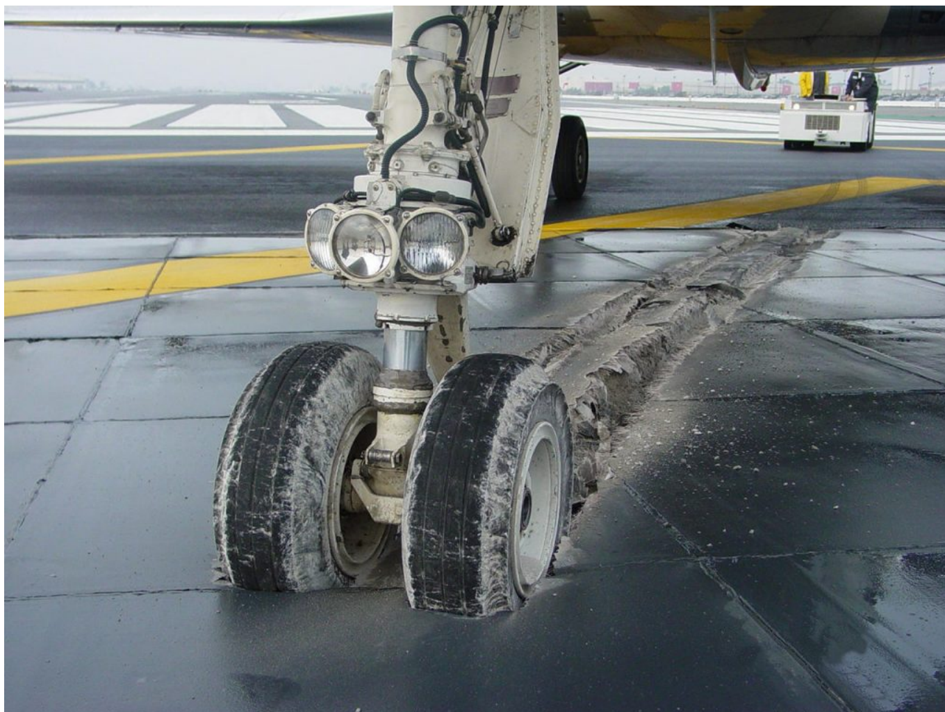
EMAS Arrestor Pad in action.