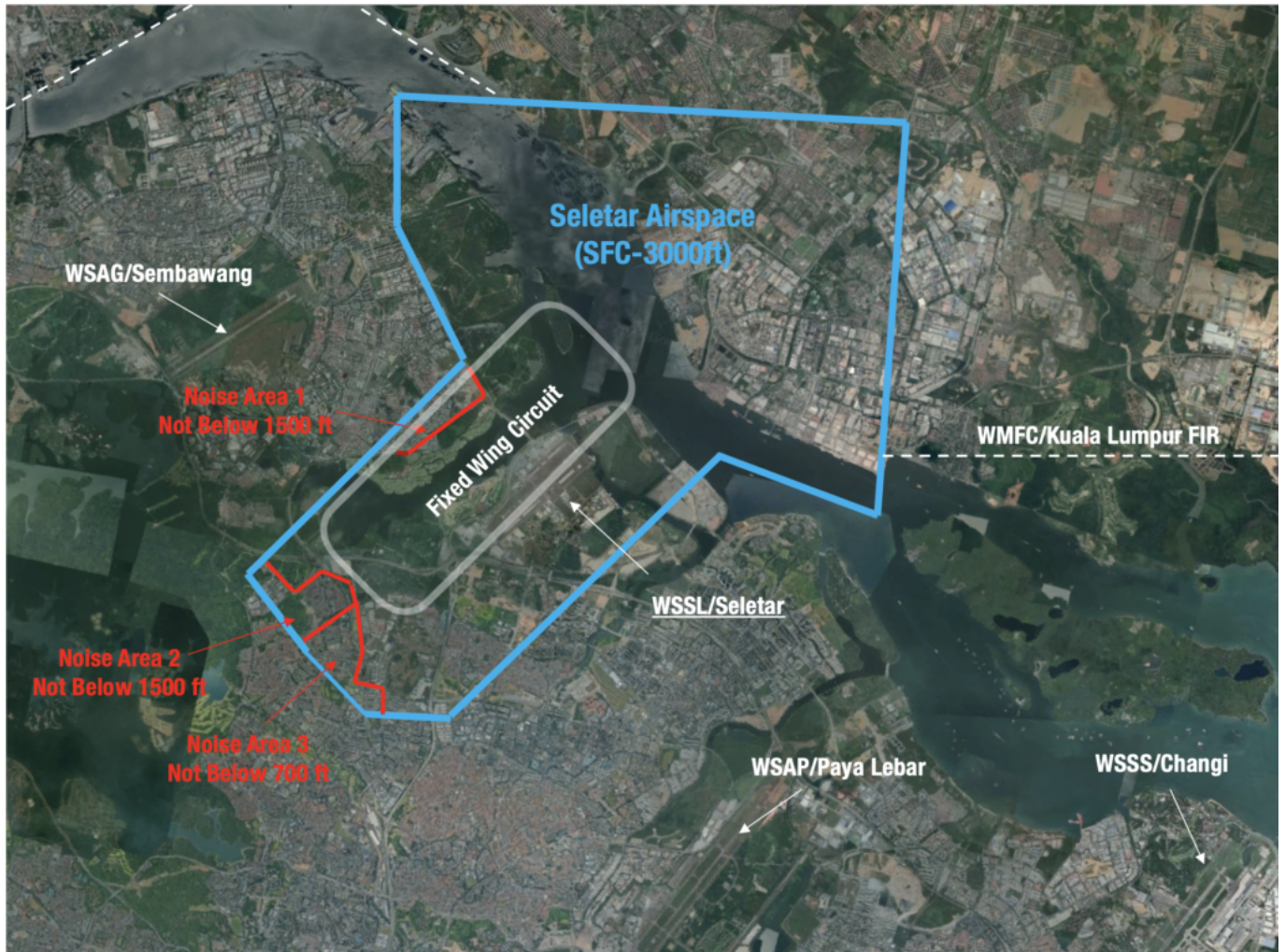
The Seletar 'Fish Bowl'