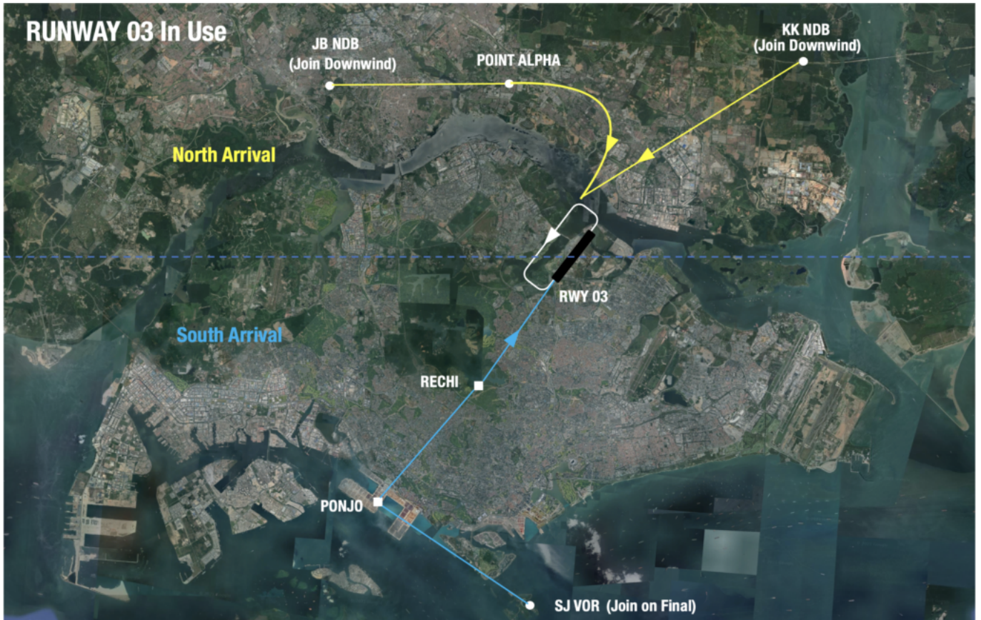
Arrivals onto Runway 03