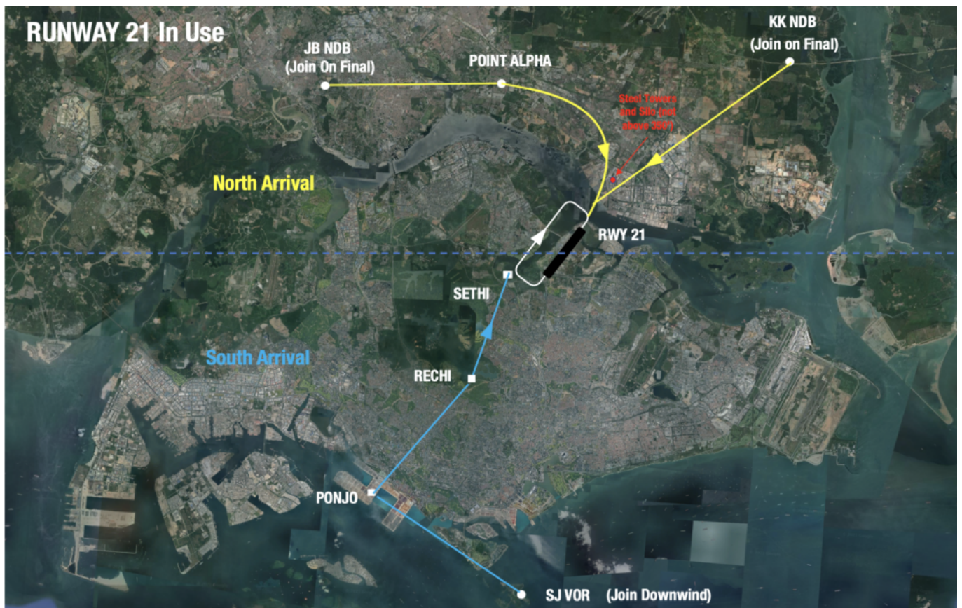
Arrivals onto Runway 21 - make sure you have the 'steel towers and silo' in sight for an earlier approach clearance.