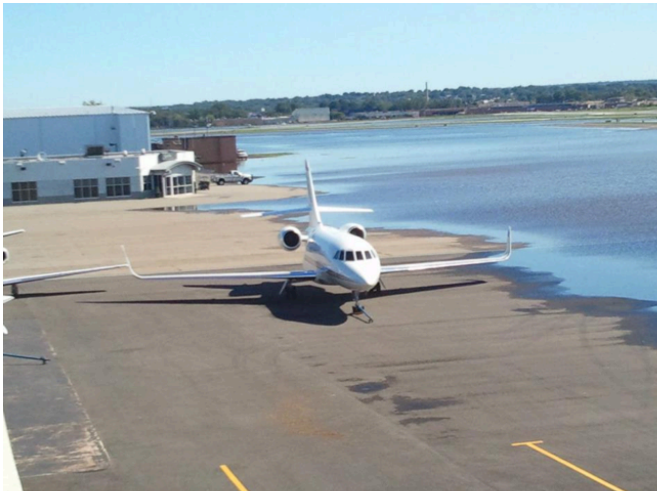
Teterboro Airport, NJ, pictured on Monday morning.