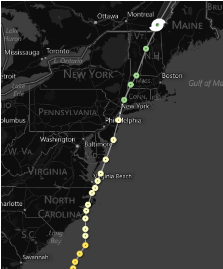
The track across the US over the weekend

As of Monday afternoon, we have the following information from Airports affected by the hurricane.