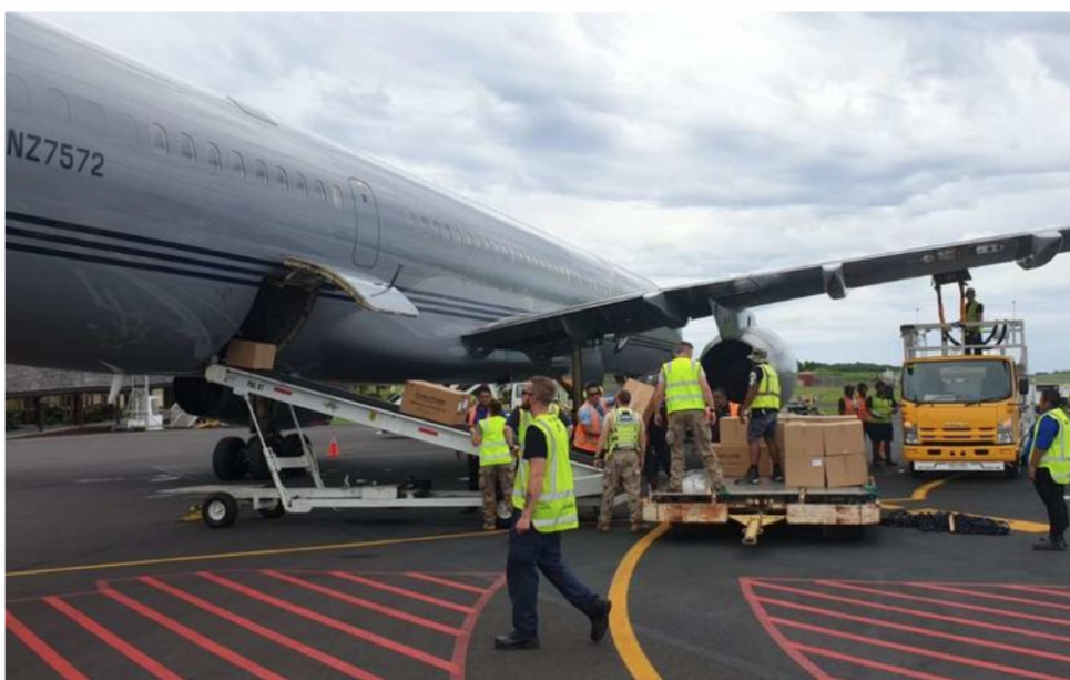
A Royal New Zealand Air Force Boeing 757 offloads medical stores in Samoa.

Medical teams from around the world are now working with UNICEF to bring in vaccines to support the Samoan government's vaccination programme.