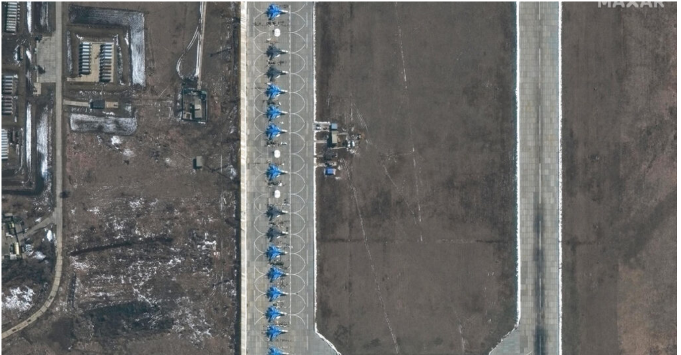
Russia military aircraft close to the Ukraine border.