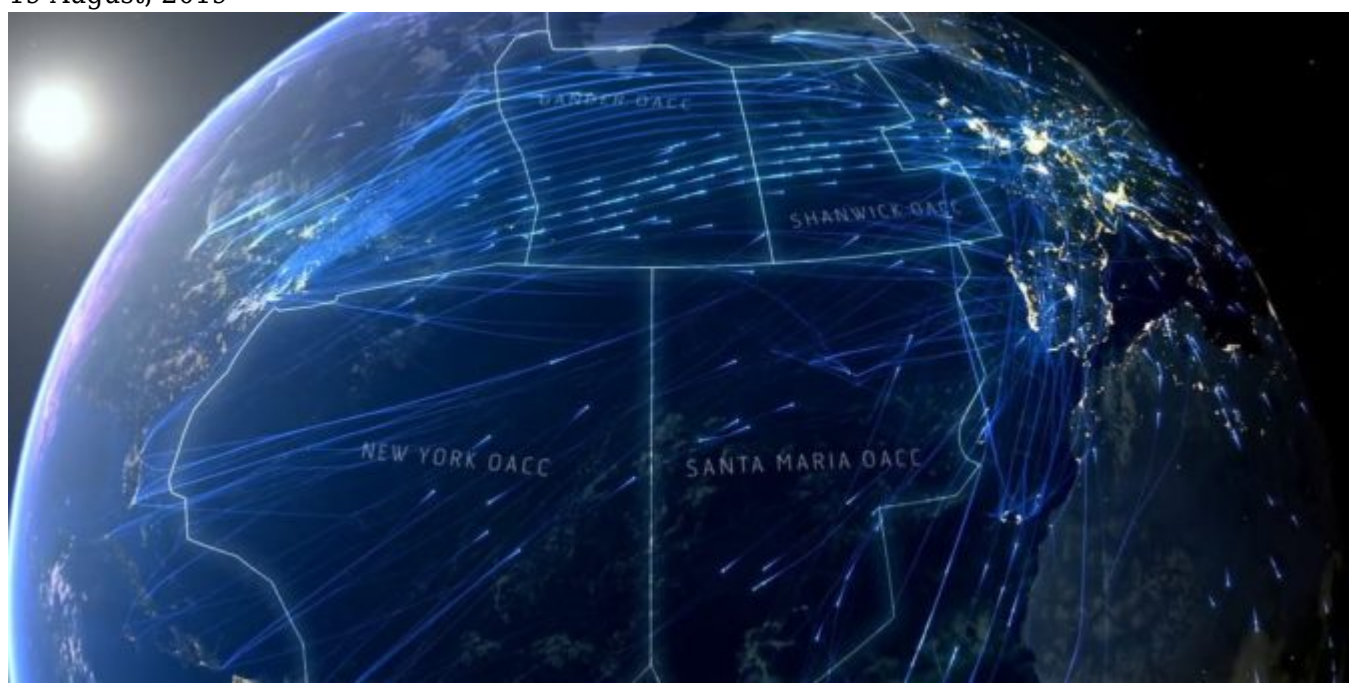
U.S. operators with the old MNPS approvals issued before 2016 have until 31 Dec 2019 to get these updated if they want to keep flying on the North Atlantic!

The FAA issued new guidance on this on 18 July 2019: