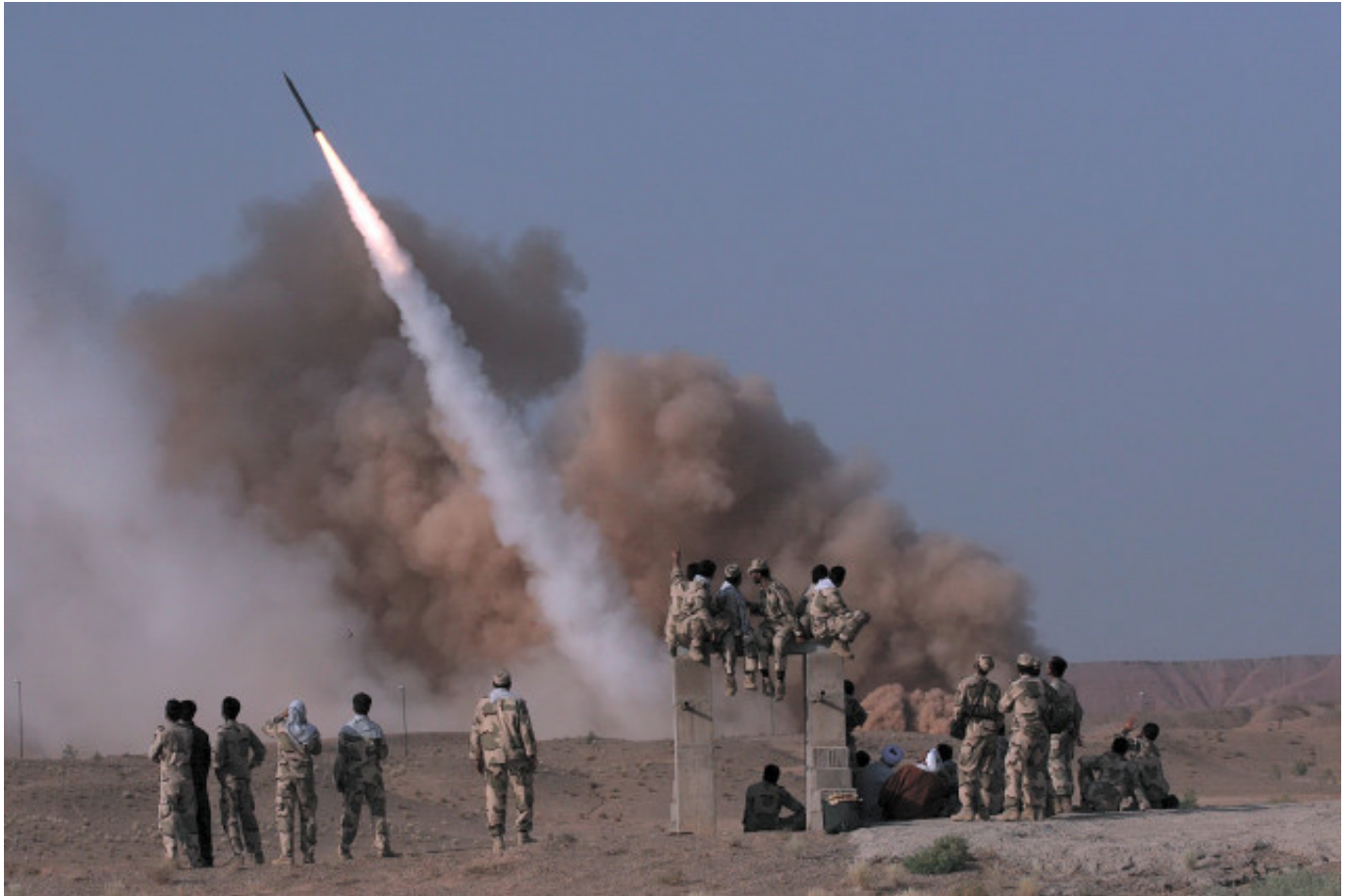
Rockets fired at Basra airport