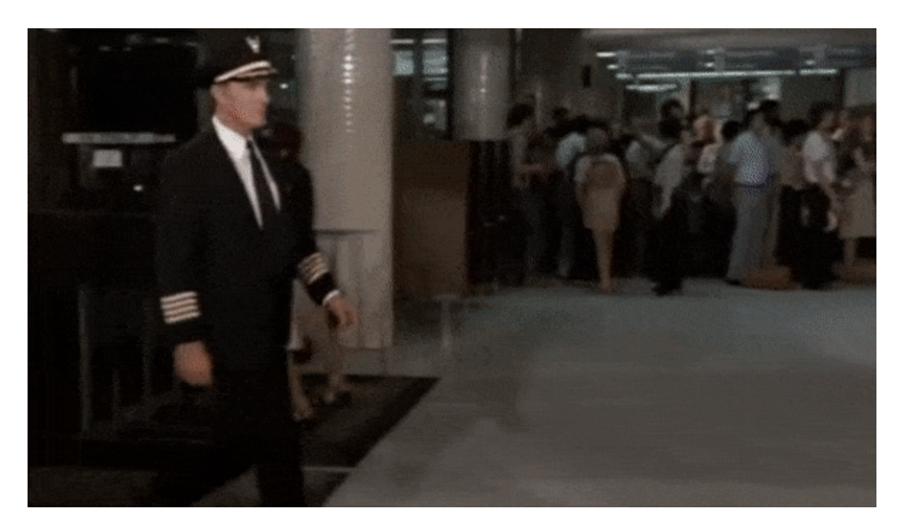
Don't be this guy.

Layovers were tough for most. I once had a 72-hour layover locked in my room in Korea. Instead of complaining I soaked in the tub, watched movies, I ordered room service, wrote, and caught up on emails. What was perceived as torture to many crews would be a vacation to any stay-at-home mom. I opted to turn my situation into a hotel staycation. Perspective. Change your perspective on any negative situation and you will improve the quality of your life.