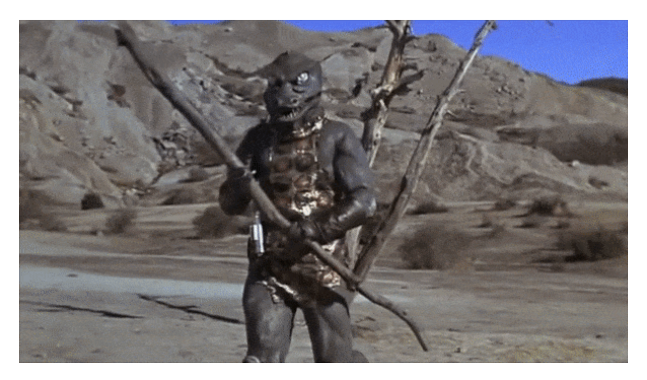
We've all been there.

But we no longer need those same survival skills because we don't have the same threats in our external world. Thus, the mind defaults to survival from threats within and will create a threat that is not there. We ruminate, worry, and catastrophize. We think about how someone harmed us, we regret what we did, we bemoan what we should have done, and we fear what the future might look like. The trick is training your mind to not go there and convincing it to travel down a different path.