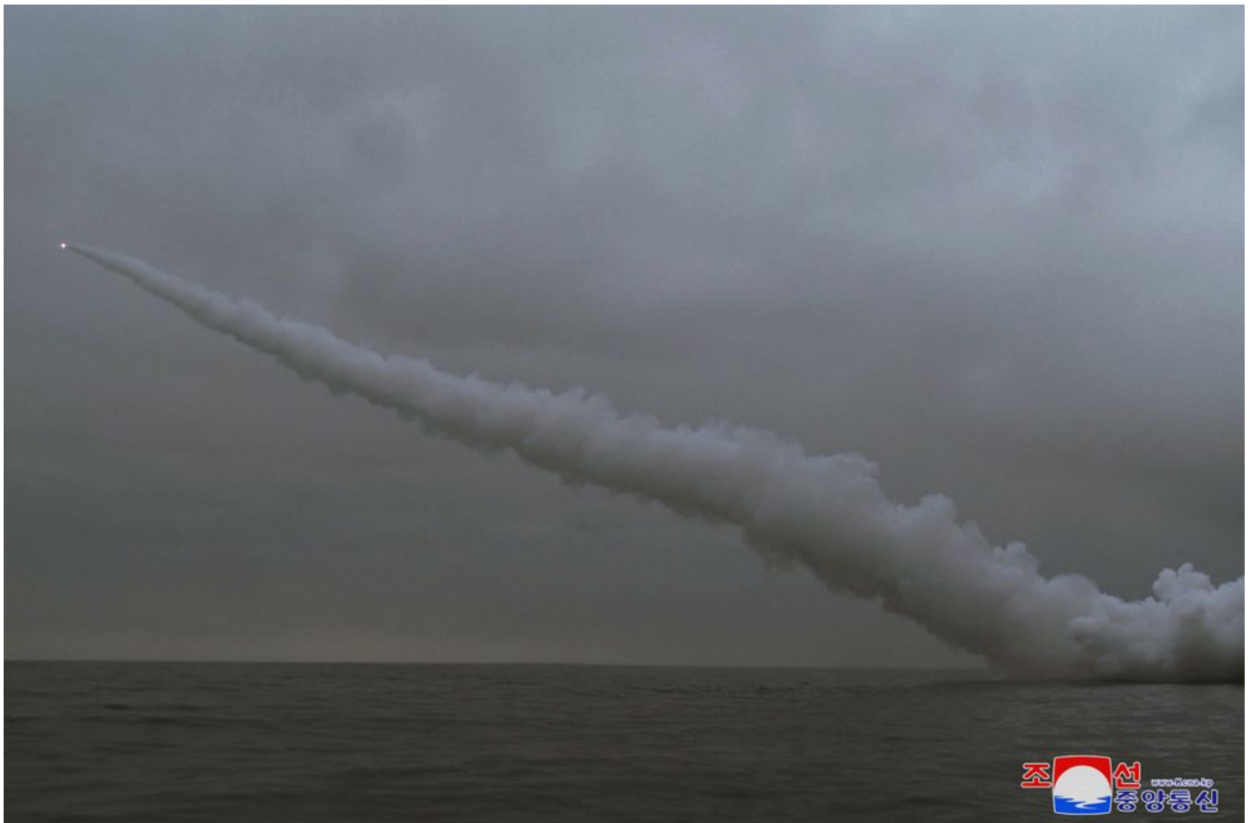
Image of recent missile firing from submarine