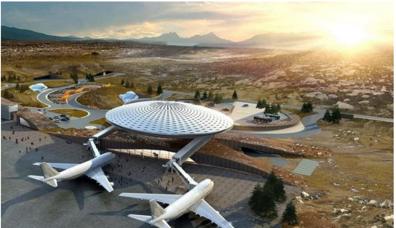
Daocheng Yading Airport

Airports at these altitudes will have special procedures for take-off and landing and you are unlikely to be operating into them without prior training. So, which should we pay attention to?