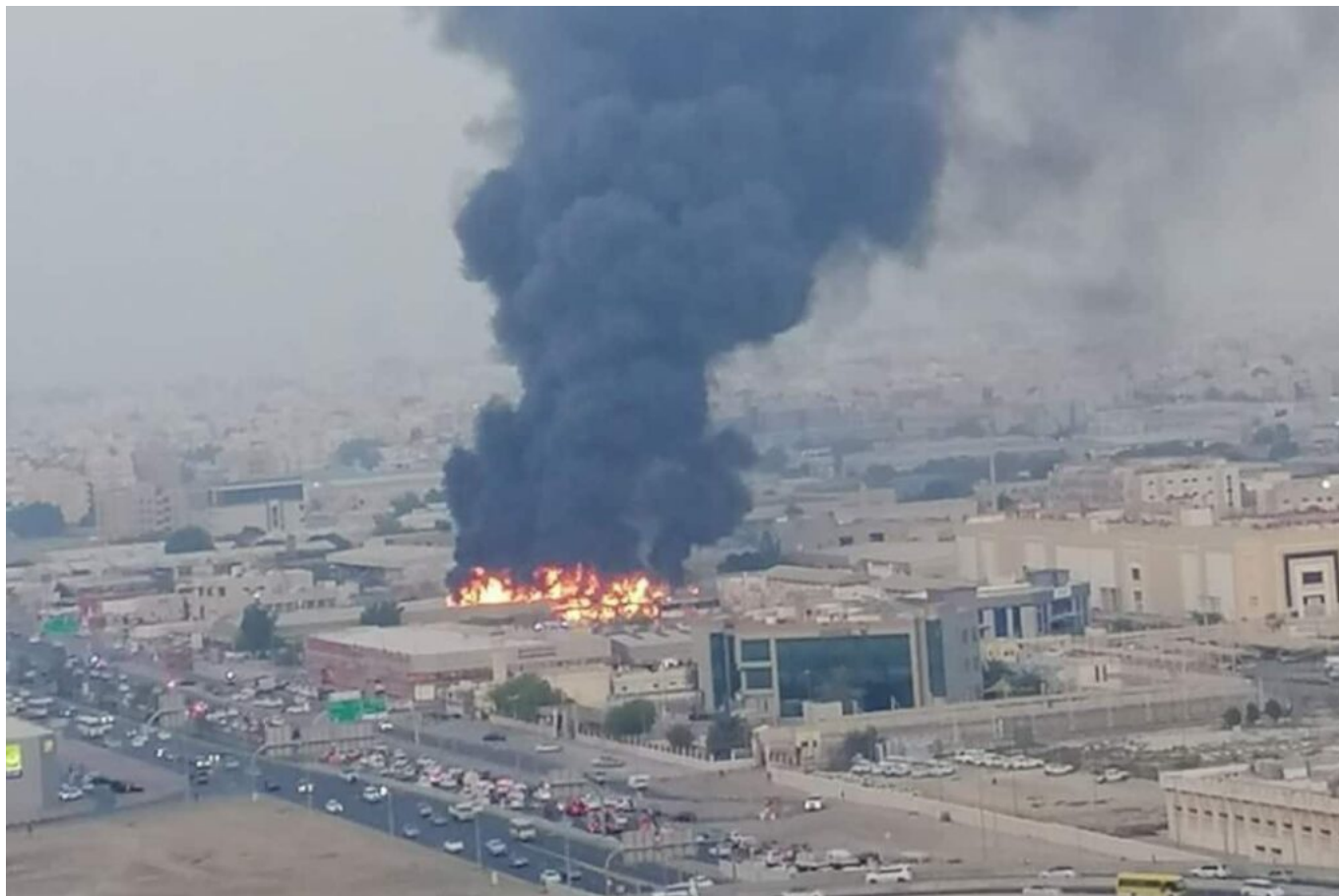
Smoke and flames from oil tankers targeted near OMAA/Abu Dhabi Airport.