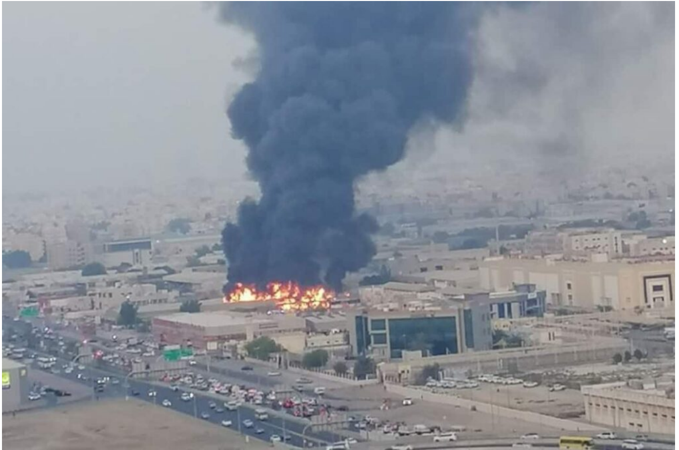
Smoke and flames from oil tankers targeted near OMAA/Abu Dhabi Airport.