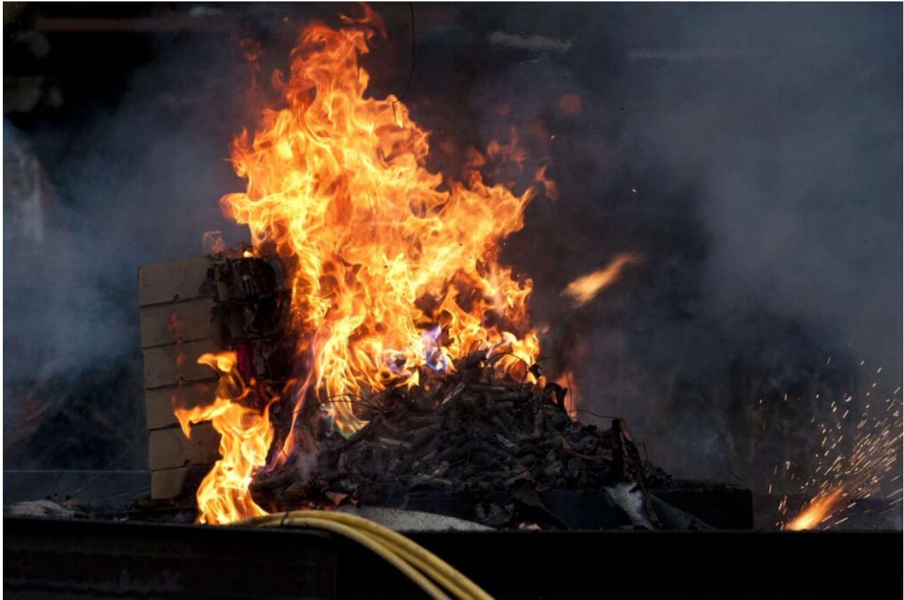
An FAA fire test with 5000 lithium ion cells