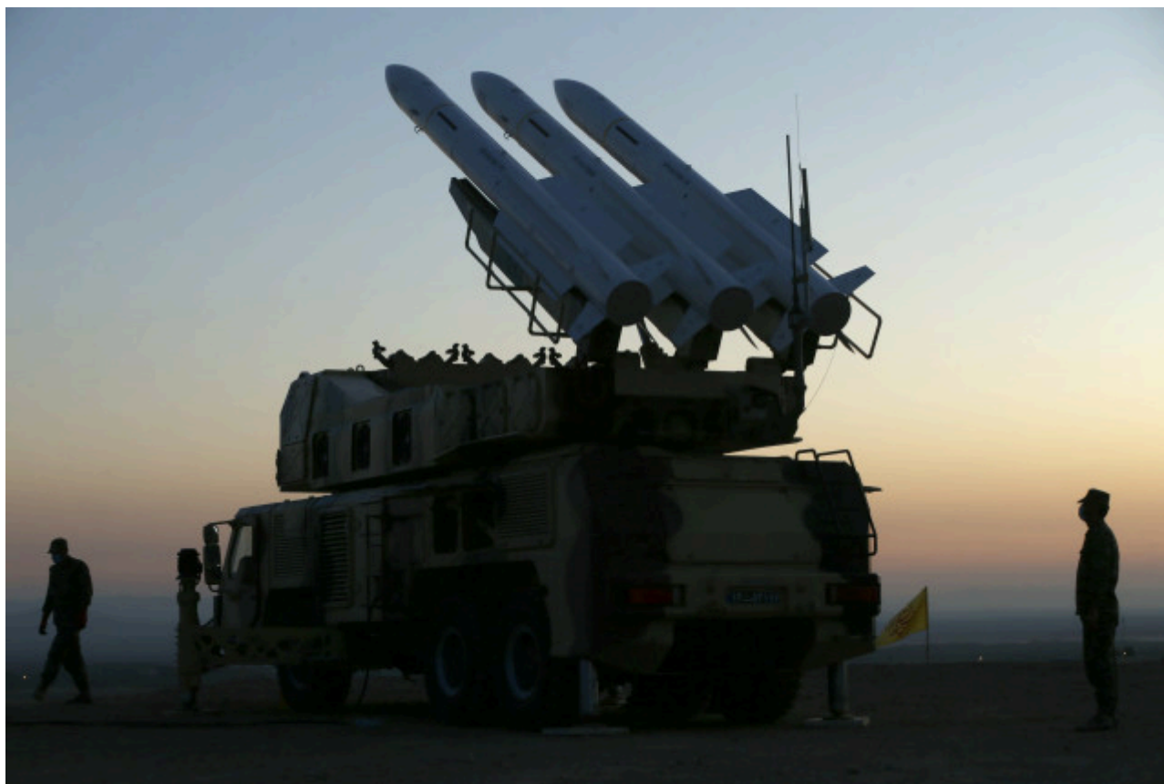
The Iranian 'Air Dome' Defense system

As with all risk, likelihood is dependant on capability (they have that), and intent .