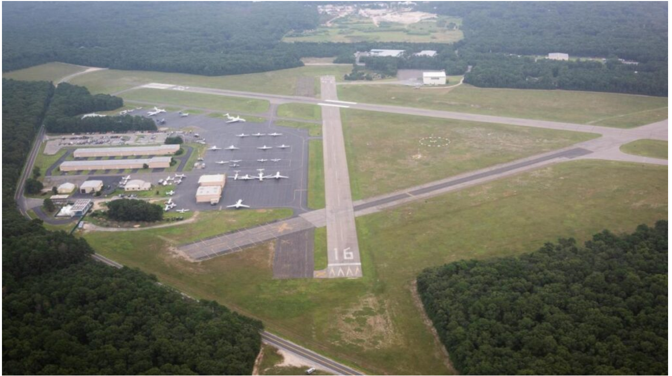
KHTO/East Hampton Airport