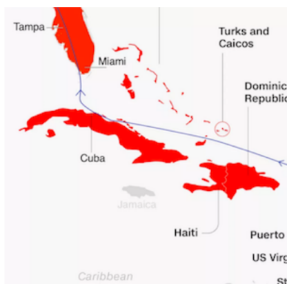
Latest Airport Status after Irma

SITA HNLFSXH AKLFSXH AFTN KMCOXAAL EMAIL INTL.DESK@FSBUREAU.ORG