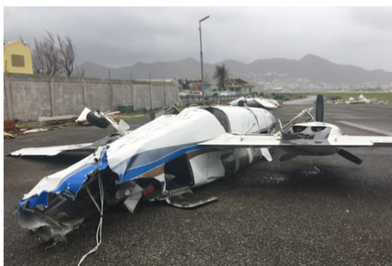
Hurricane Maria - trail of Airport destruction - latest status