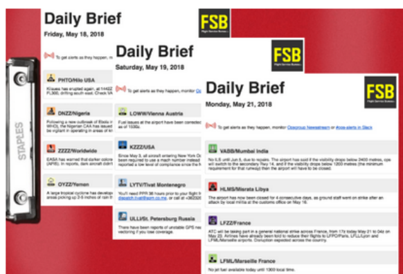
New Daily Brief from FSB

Weekly International Ops Bulletin published by FSB for OPSGROUP covering critical changes to Airports, Airspace, ATC, Weather, Safety, Threats, Procedures, Visas. Subscribe to the short free version here, or join thousands of your Pilot/Dispatcher/ATC/CAA/Flight Ops colleagues in OPSGROUP for the full weekly bulletin, airspace warnings, Ops guides, tools, maps, group discussion, Ask-us-Anything, and a ton more! Curious? See what you get. Rated 5 stars by 125 reviews .