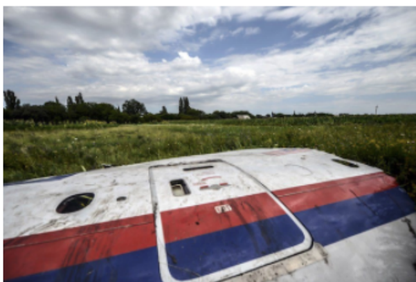
Notams: We've started work