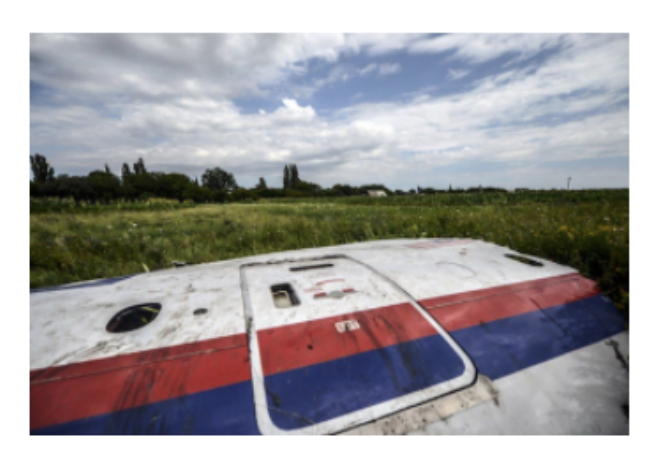
Notams: We've started work