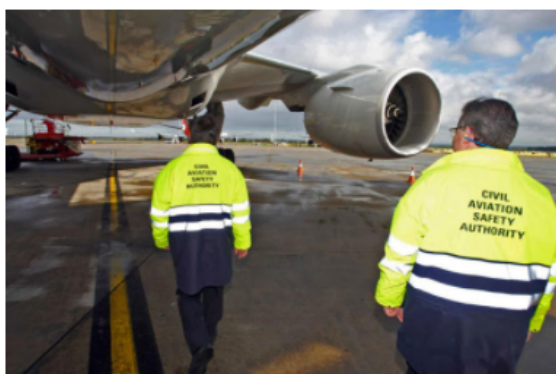
That MMEL thing: here's an update