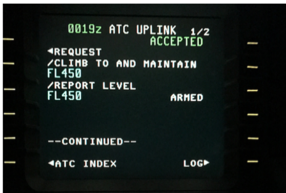
Iridium Satcom fault leads to ATC ban