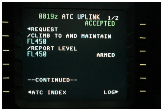
Iridium Satcom fault leads to ATC ban