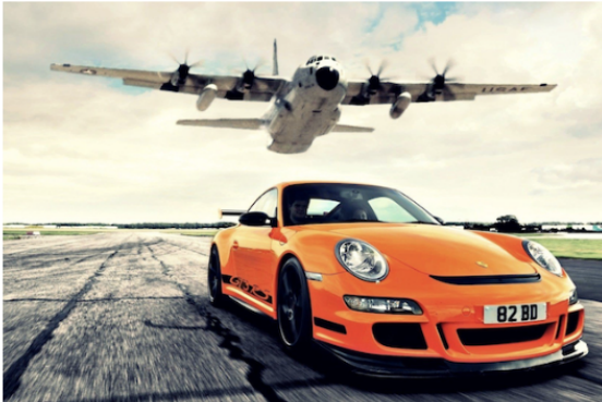
CYYR/Goose Bay closed because of ... sticky runways