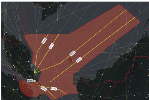
PBCS is coming to Singapore