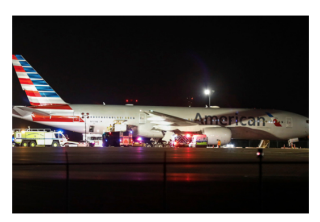
Bermuda as a NAT alternate ...

Weekly International Ops Bulletin published by FSB for OPSGROUP covering critical changes to Airports, Airspace, ATC, Weather, Safety, Threats, Procedures, Visas. Subscribe to the short free version here, or join thousands of your Pilot/Dispatcher/ATC/CAA/Flight Ops colleagues in OPSGROUP for the full weekly bulletin, airspace warnings, Ops guides, tools, maps, group discussion, Ask-us-Anything, and a ton more! Curious? See what you get . Rated 5 stars by 125 reviews .