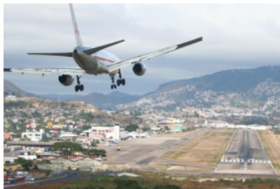
Honduras Ops affected by crisis

Weekly International Ops Bulletin published by FSB for OPSGROUP covering critical changes to Airports, Airspace, ATC, Weather, Safety, Threats, Procedures, Visas. Subscribe to the short free version here , or join thousands of your Pilot/Dispatcher/ATC/CAA/Flight Ops colleagues in OPSGROUP for the full weekly bulletin, airspace warnings, Ops guides, tools, maps, group discussion, Ask-us-Anything, and a ton more! Curious? See what you get. Rated 5 stars by 125 reviews .