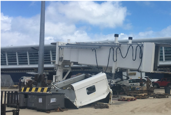
Caribbean Update - latest from PR, Virgin Islands, St. Maarten