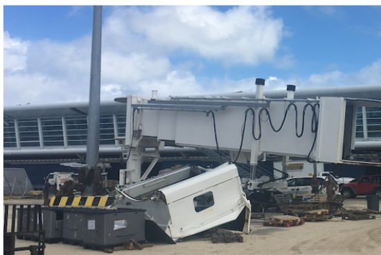
Caribbean Update - latest from PR, Virgin Islands, St. Maarten