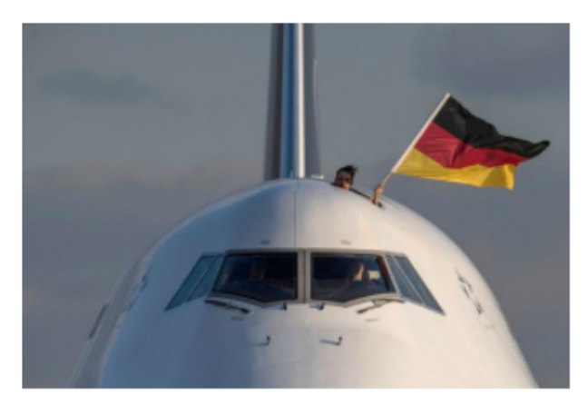
Expect breathalyzer during German Ramp checks