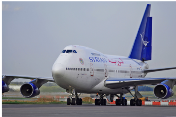
Which airlines are still flying over Syria?

Weekly International Ops Bulletin published by FSB for OPSGROUP covering critical changes to Airports, Airspace, ATC, Weather, Safety, Threats, Procedures, Visas. Subscribe to the short free version here, or join thousands of your Pilot/Dispatcher/ATC/CAA/Flight Ops colleagues in OPSGROUP for the full weekly bulletin, airspace warnings, Ops guides, tools, maps, group discussion, Ask-us-Anything, and a ton more! Curious? See what you get. Rated 5 stars by 125 reviews .