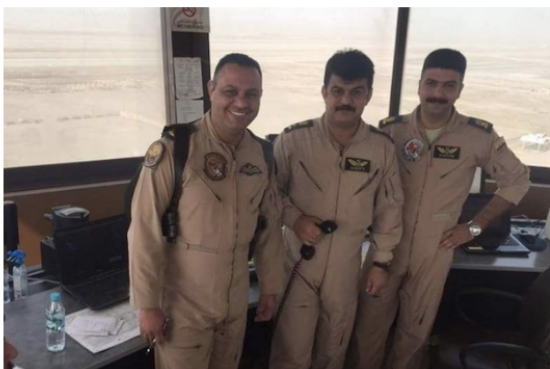
Iraq ATC strike over - Baghdad FIR open